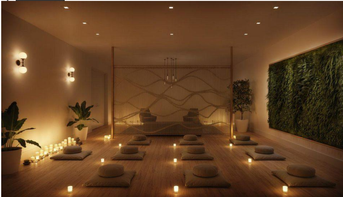
Both adults and kids can use the MNDFL-designed meditation room at Gramercy Square on East 19th Street. vuv

With gyms and screening rooms becoming as standard as stainless steel appliances and marble bathrooms in luxury residences, Manhattan developers are thinking bigger when it comes to building amenities.