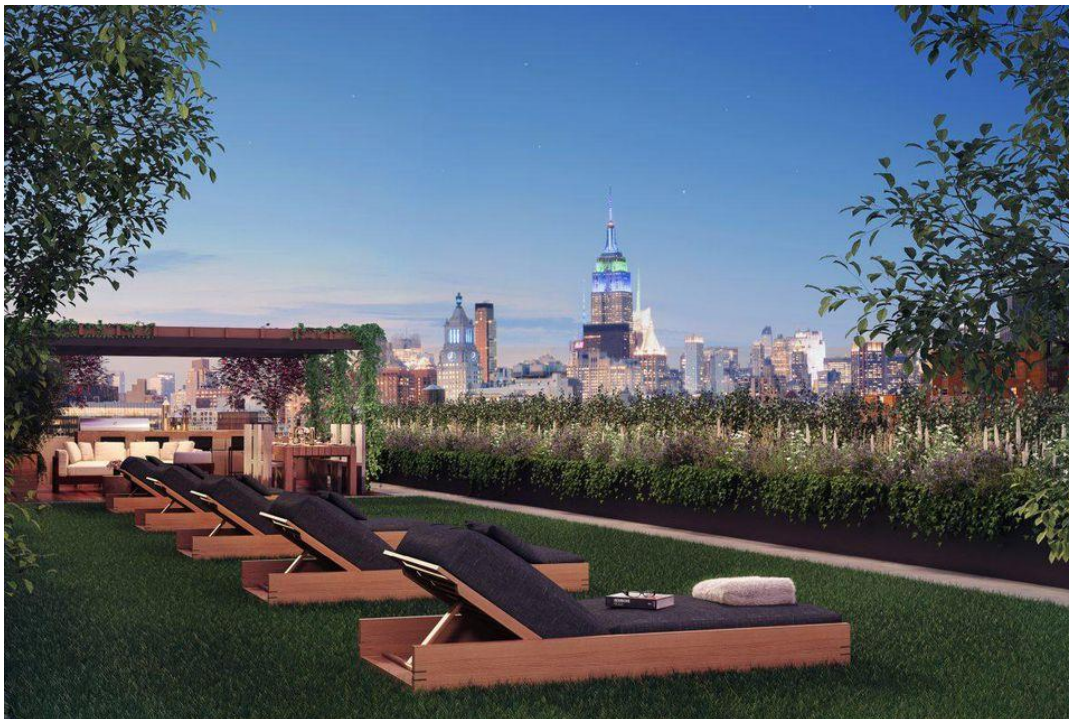
The 4,100-square-foot rooftop terrace at 196 Orchard comes with a sky lawn and outdoor shower, cabana seating and two kitchens.

“We find that screening rooms are rarely used, but when they are used they are used by a lot of people in the building, such as for the Super Bowl,” Till says.